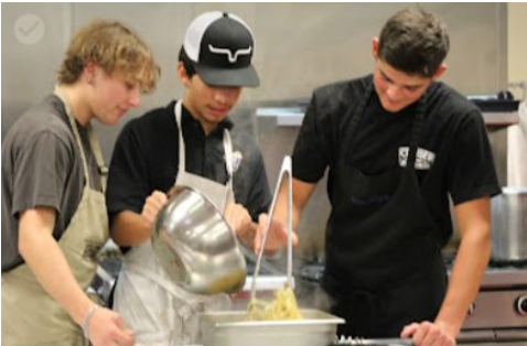
Front page photos provided by The Stampede