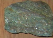
Mica var. Fuchsite (Green Mica)