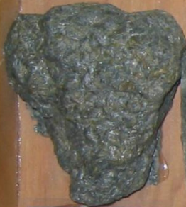
Epidote var. Pistacite Crystals