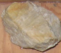
Magnesite (precursor to talc)