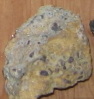
Corundum (Pink Sapphire)