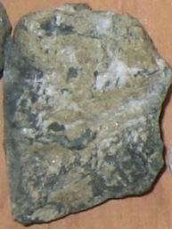
Pistacite and Chlorite