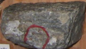
Iron Pyrite Crystals