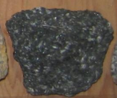
Diorite (Hornblende, Biotite Mica, Feldspar)