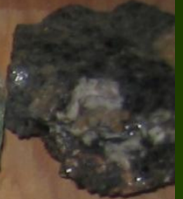
Mica var. Biotite