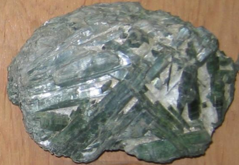
Actinolite var. Actinolite with Talc