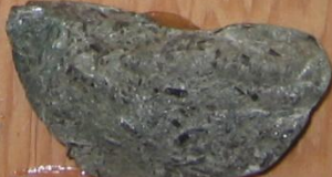
Tourmaline on Actinolite