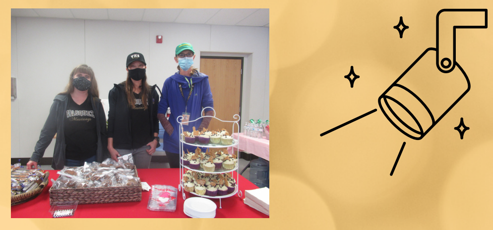
VHS: Mark Your Calendar

VHS PTSO had the honor of providing another staff luncheon in which StoneFire Grill delivered boxed lunches and desserts were provided by 'With Love' baking company in the form of cookies, cupcakes and chocolate-covered pretzels. Additionally, PTSO is working in collaboration with ASB to provide a Spring Festival event for the community on April 9th in which families can enjoy a day of games, food, raffles and music; there will be a variety of song and dance numbers ranging from folk music to violin to hip-hop! A weird science table will be set-up for kids to enjoy some fun with slime! And.... a very special bunny will be available for photographs! -- VHS PTSO Better Together!